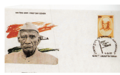
FDC commemorating Shyam Lal Gupt. The postmark features the national flag.

(World-conquering tricolour dear to us, May our flag always fly high)